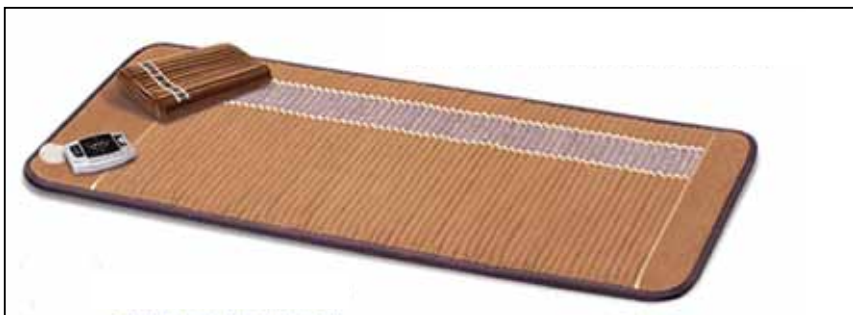
Figure 2 The amethyst BioMat and the Time/Temp control

as revealed in the ICAP brain scan and heart scan, as well as a reduction in cortisol levels.